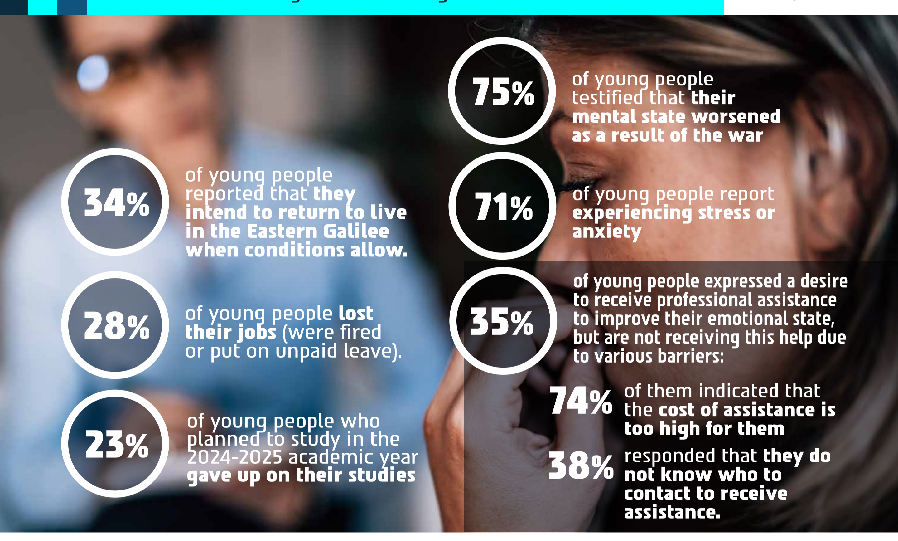
2. From the data of a youth survey conducted by the Brookdale Institute for the Youth Authority. The survey was conducted in January-February 2025 and 216 young people aged 18-34 from the northern border region participated.